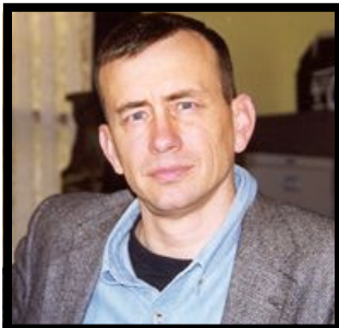
Lt. Col. Dave Grossman

Lt. Col. Dave Grossman is a former West Point Psychology Professor, Professor of Military Science, and an Army Ranger who has combined his experience to become the founder of the field of scientific endeavour, which has been termed “killology”.